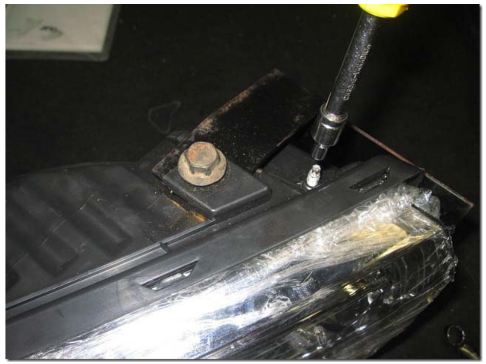
Here is the adjuster screw to align them, which you access in the front hood opening.