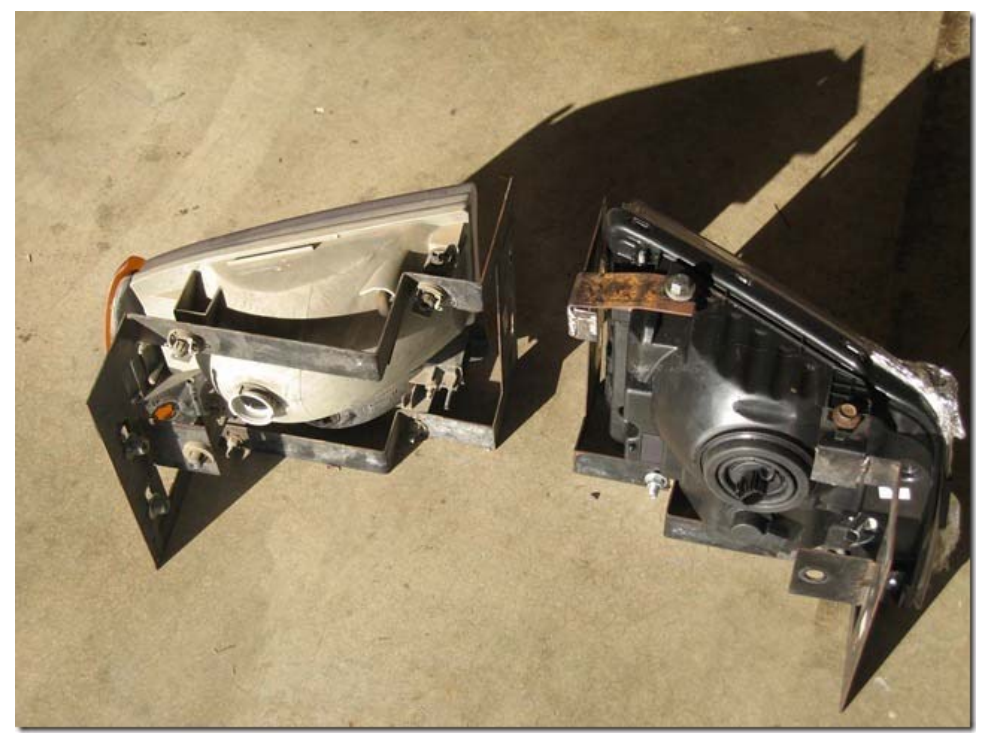
This is the best picture of what needs to be done at the top of the bracket. Old light on left, new on right. Basically, the 2007 lights are internally adjustable via the tiny adjuster just above the new bracket on the left side of the new headlight assembly. Because of that, the housings bolt solid to the brackets, rather than the complex adjustment screws of the originals. For some reason, the older F250/F350s have holes for the new mounting points of the 2007 lights, but you have to add them to the D;s bracket. Also, the upper part of the original bracket hits the back of the new assembly, so just cut it off and weld on a couple of bent tabls. there is actually enough metal in the piece you cut off to make the new brackets. On this first on e(on the right), I used a chunk of flat iron I had before I realized that. Build one at a time soi you make sure you keep the new lens in the same plane as the old one.