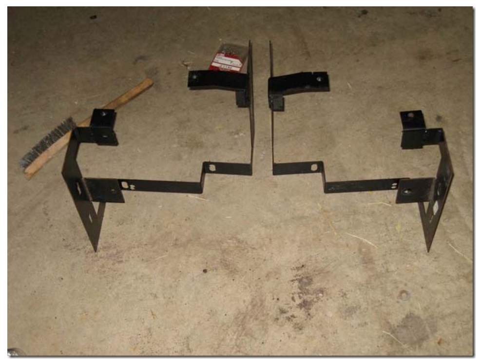
Quick shot of paint on the welds and time for a beer!