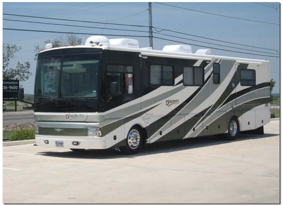
Just one more shot. The lights will be much brighter as headlight design has come a long way since 1999 (original style) to 2007.