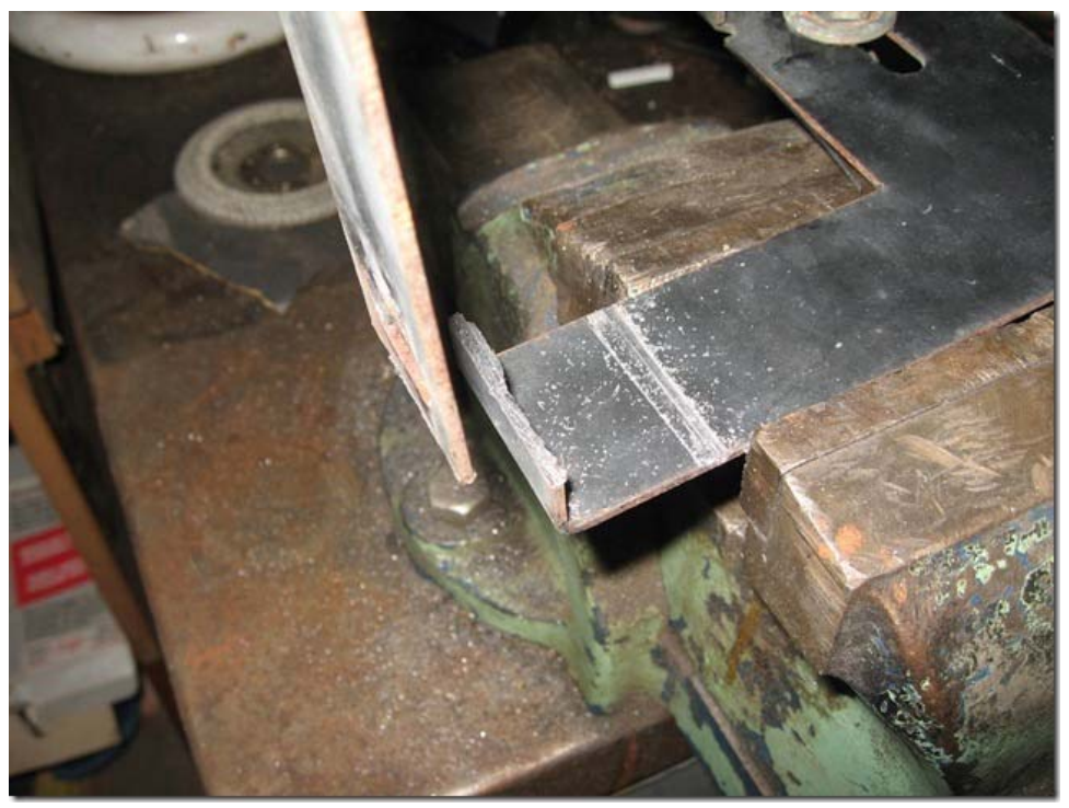
Bottom of each bracket. You need to cut the corners off, but you simply flip over and re-weld back on.

I was curious ... I asked on the egroup if anyone had ever upgraded the headlights on their D. No one had, but several asked for details if I decided to do it. I did, and here are the results. The original headlights were late 9-s Ford Super Duty lights. It's a bit hard to explain, but once you lay the original bracket onto the new headlight assemblies, it's pretty clear what you have to do. The original light assemblies are two pieces. One is the headlight, the other the turning signal/side marker. The 2007 assemblies are one single unit. The bottom of the new lights bolt to the same holes the original turning signals did. But the D's bracket isn't quite the shape of the front firewall of the truck's and one corner will not clear the plastic. So, a simple cut, flip and weld of that corner did the trick.