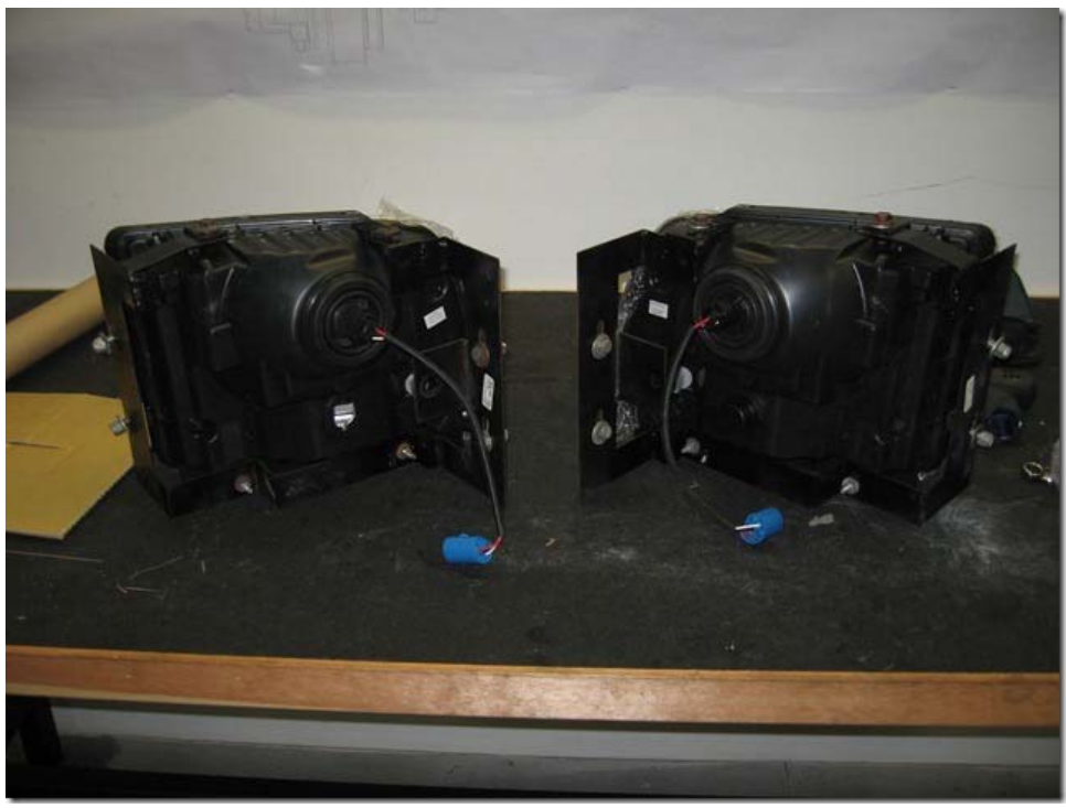
Here are the two new headlights bolted to the modified brackets. The two adapter harnesses convert the new bulb sockets to the old. They come with the kit.