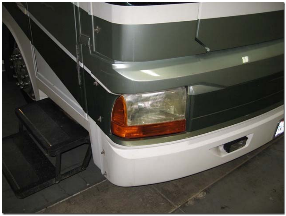
I took before and after photos of the headlights. This is the BEFORE.