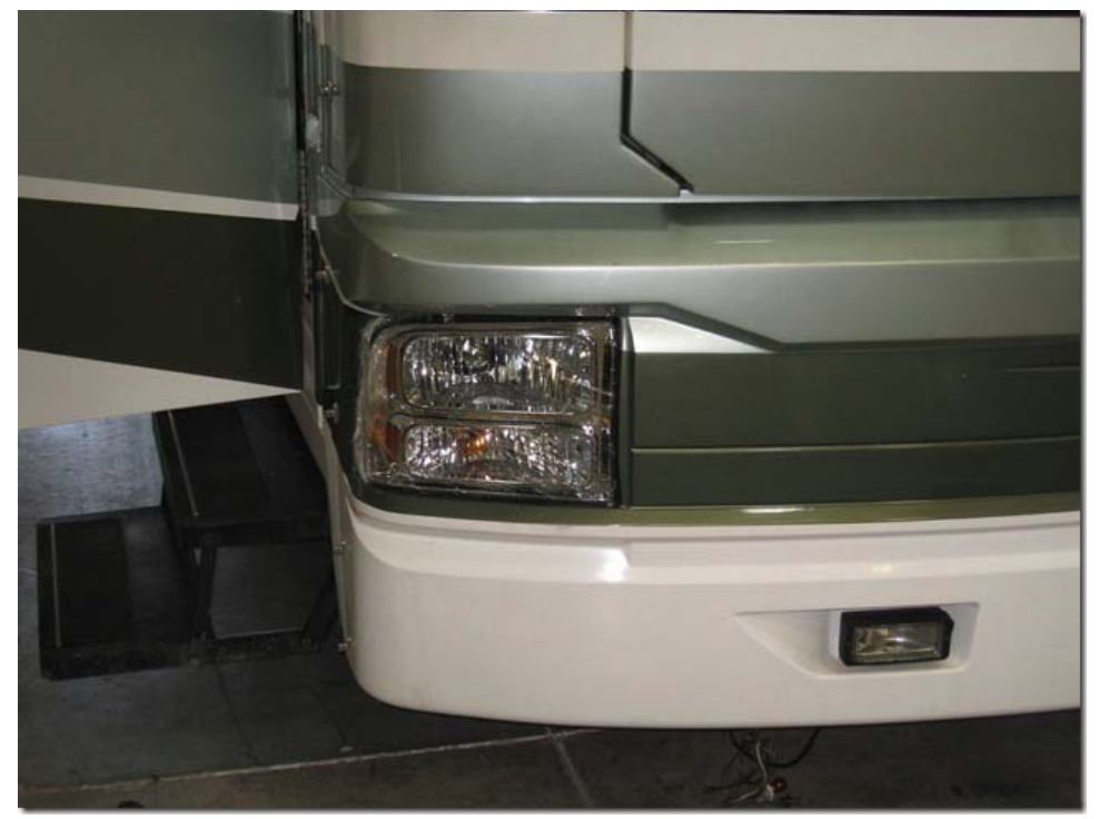
This is AFTER. The new headlights fit the nose opening perfectly, but I did have to modify the brackets a bit. I think they look better than the originals. Sorta like given your old Discovery a nose job! In this picture, the headlights still had the protective cellophane on the face and they weren't bolted in yet.