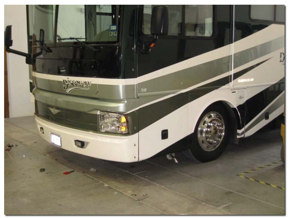
Here is the finished product. very clean and 'way more modern than original. Note floor: the two tools I always have at hand – pliers and a Blackberry!