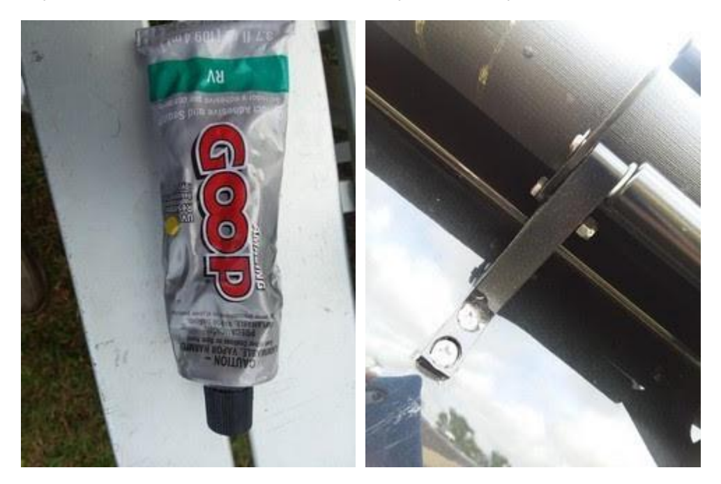
That's it. You can see in the photo below how much straighter the slide roller is. The topper is nice and tight in the center and looser toward the ends so it drains naturally.