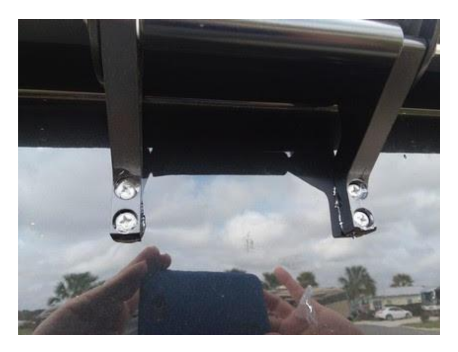
Now it is time to install the two 7/16 bolts and Nylock nuts through the arms and holes in the frame to lock the upper roller in position. Easy but having a 7/16" ratchet wrench and a 7/16" box end is helpful but not required. You can also see that the excess Goop has been wiped off.