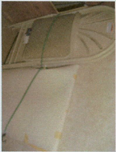
Remove chairs and table top from ward.