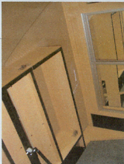
Slide room out and raise bed.