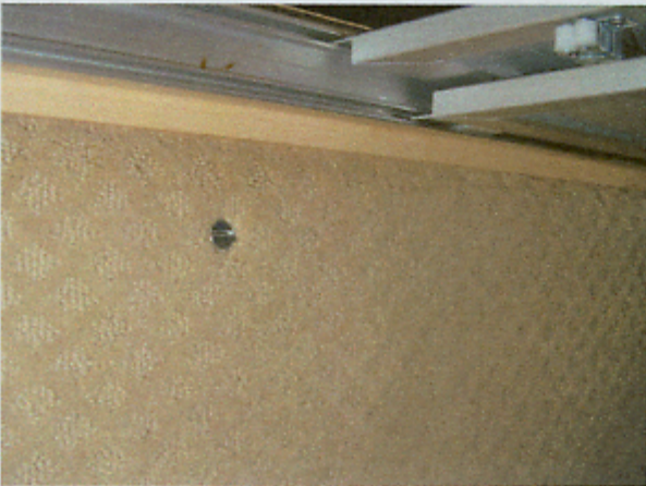
Upper section is secured by 4 screws which when removed accesses the radiator & fan.