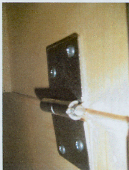
Remove hairpin clips from hinges.