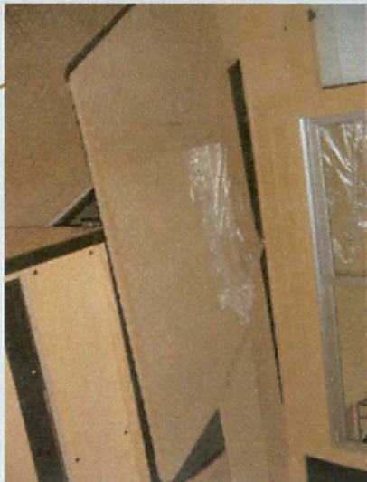
Tilt carpeted floor board as you slide it out.