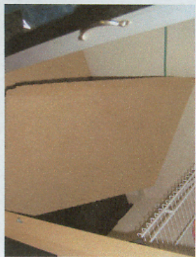
Tilt cover up from rear wall to slide out.