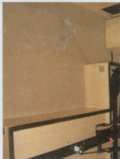
Remove L-shaped bed support.