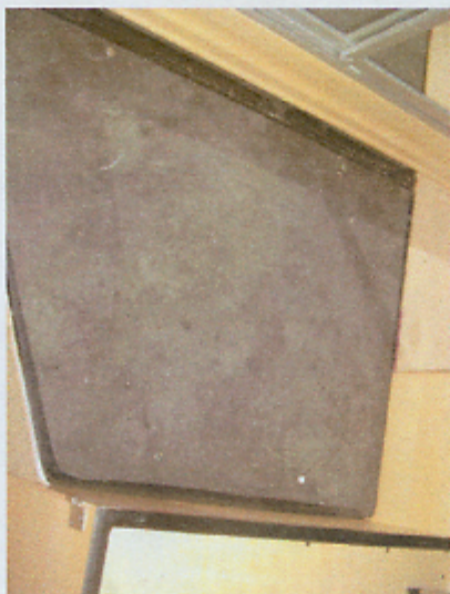
This exposes the 4 securing screws that hold the main access cover.