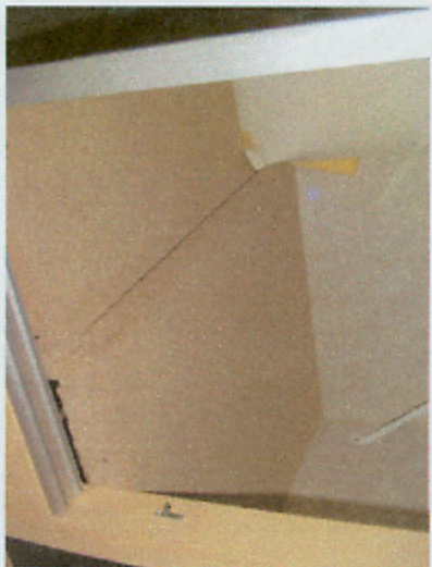
Remove air intake cover.