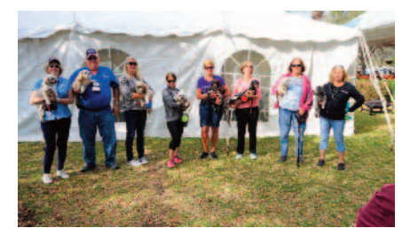
Dog Walk