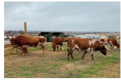
Longhorns - Rally Jan. 2020