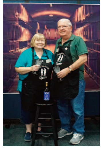
1st Lady Pat-& President Dick Tracy