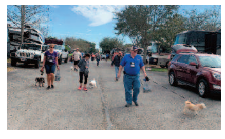
Dog Walk