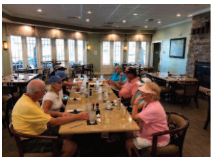
After Golf Cocktails

Our Spring rally will be in Sevierville Tennessee, on 24 April. This will be our final gathering in advance of the 2020 DOAL National Rally. More information and registration for the National rally can be found on the DOAL website. Best wishes for a great Spring and Summer and hope to see many of you in Sevierville.