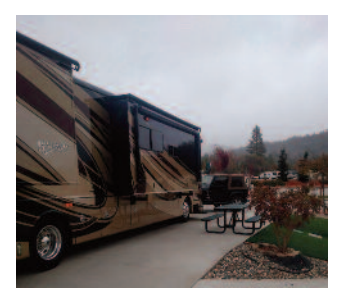
Tom Weaver checking out Black Oak RV Resort for Discovery CA's next rally