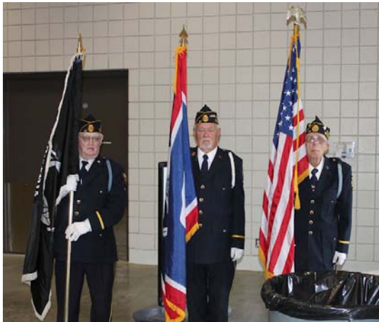
Color Guard at Welcome Party