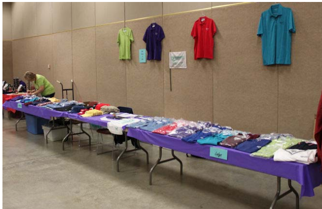
DOAI merchandise table had many good things for sale.