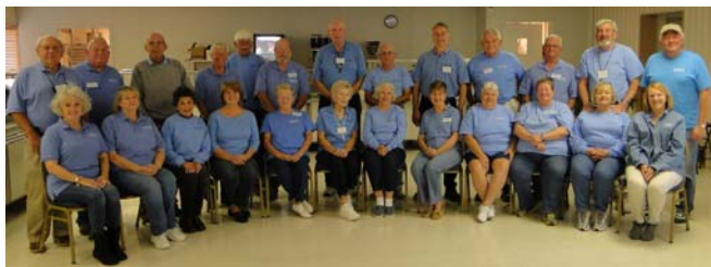
Blue Ridge Discoverys