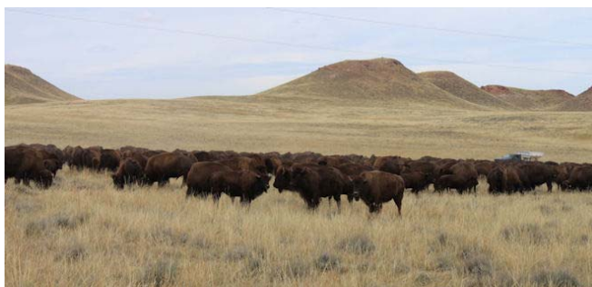
Tour of the bison ranch was fascinating and educational.