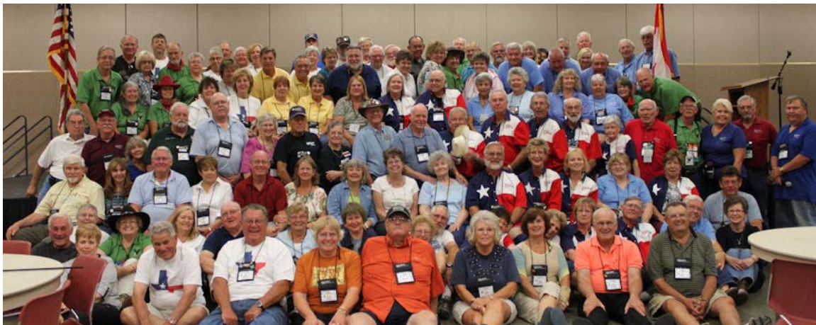
DOAI members gathered for a week filled with informative seminars, excellent food, terrific tours and golf, and the opportunity of being together with old and new friends. RVing doesn't get much better than that!