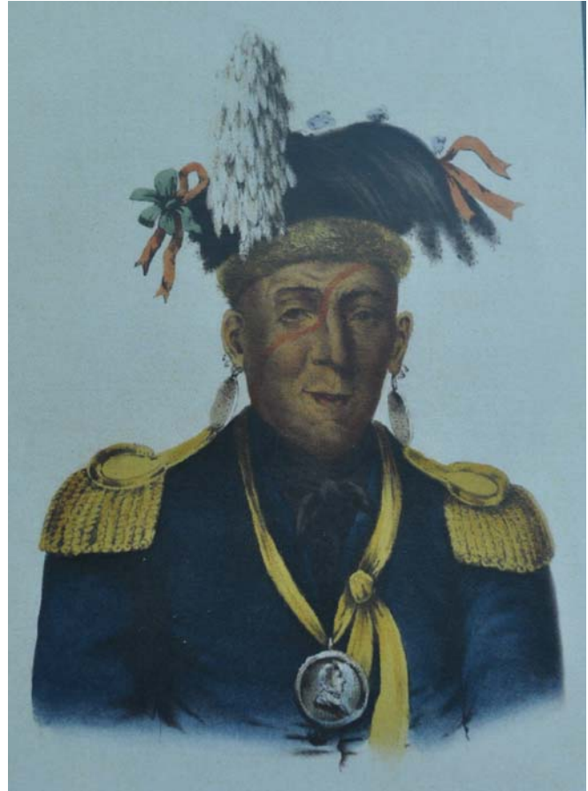
Wa-baun-see, a Potawatomi chief (spelled Wabansi in contemporary Potawatomi language)

valuable treasure preserves for future visitors and researchers material that could have been lost forever. We may have never known what these chiefs, warriors, princesses and common people looked like, except for the folio volumes with the lithographs, the generous donation, and the creation of this superb display.