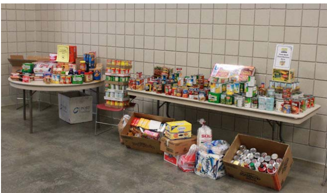
The tables were loaded with more than 670 pounds of foodstuffs. Thanks to everyone for being generous!