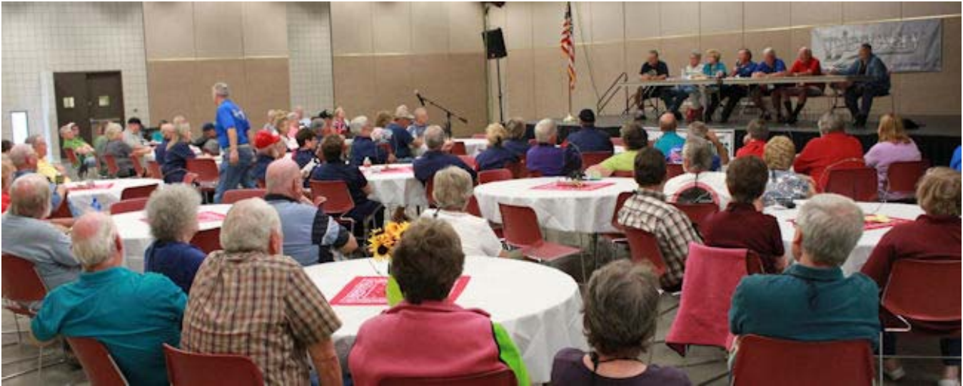
The general meeting gave everyone an opportunity to participate in the operation of DOAI.