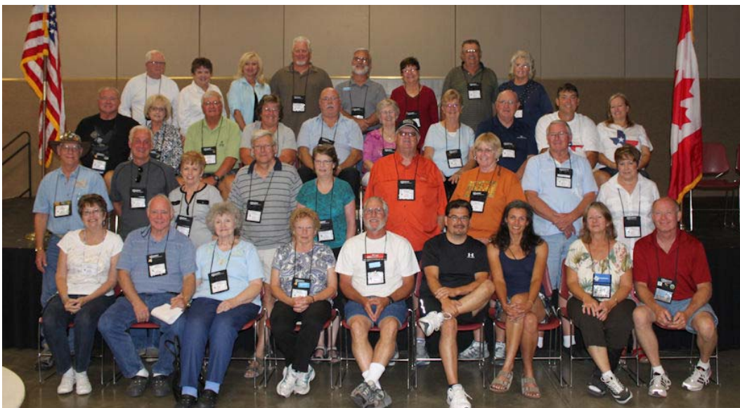
Eighteen couples attended their first DOAI national rally. A great looking group!