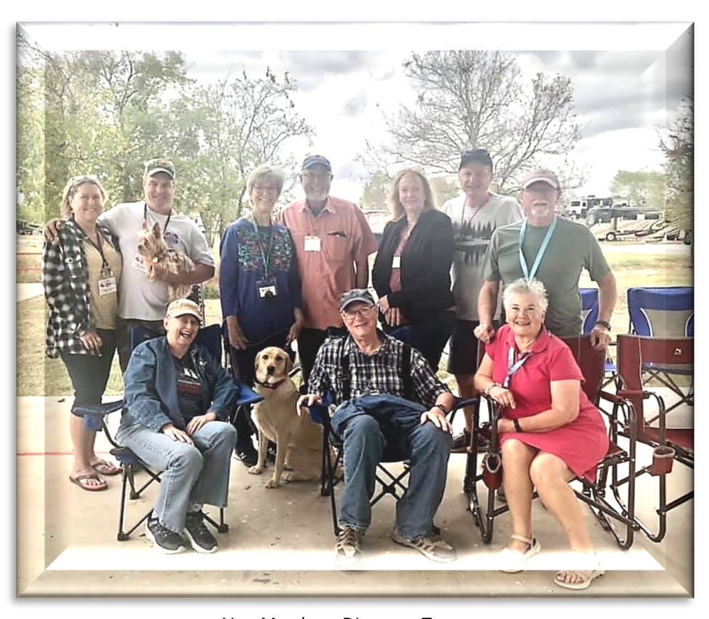
New Members, Discovery Texans