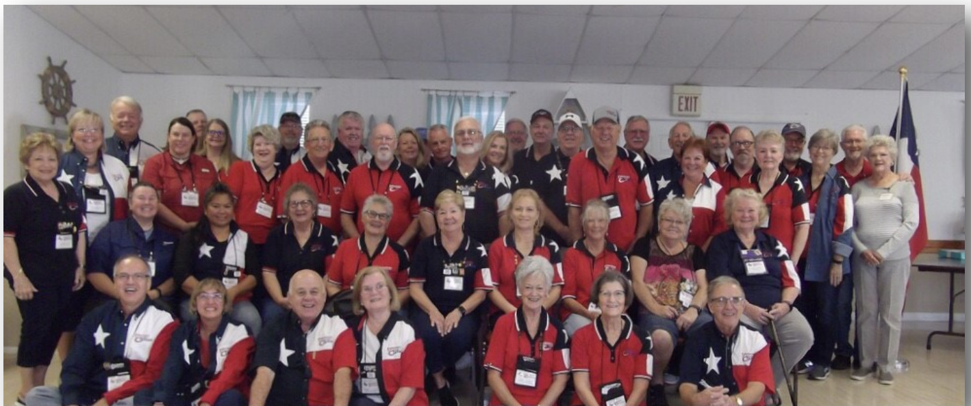
Discovery Texan attendees at the Rockport, Texas, rally in Rockport, Texas