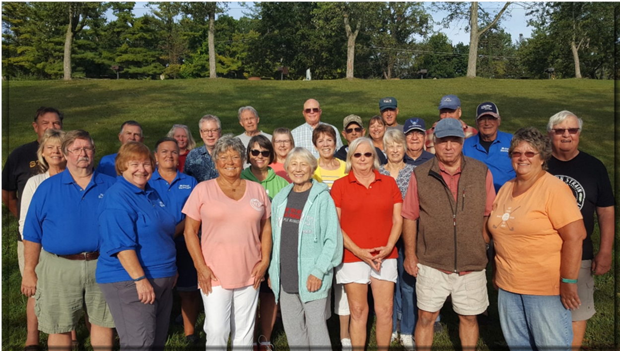
Midwest Discoverers at Camp Dearborn

The Midwest Discoverers Fall Rally is going to be in September at Wisconsin Dells following the National DOAI Rally in Gillette, Wyoming - more information to follow. This will be a great stopover for all those folks heading East after the National Rally. Safe Travels