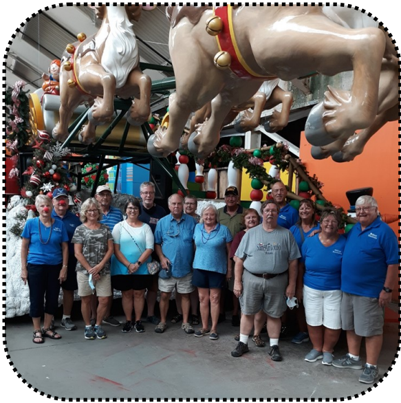
Midwest Discoverers at Parade Company under Santa Claus float