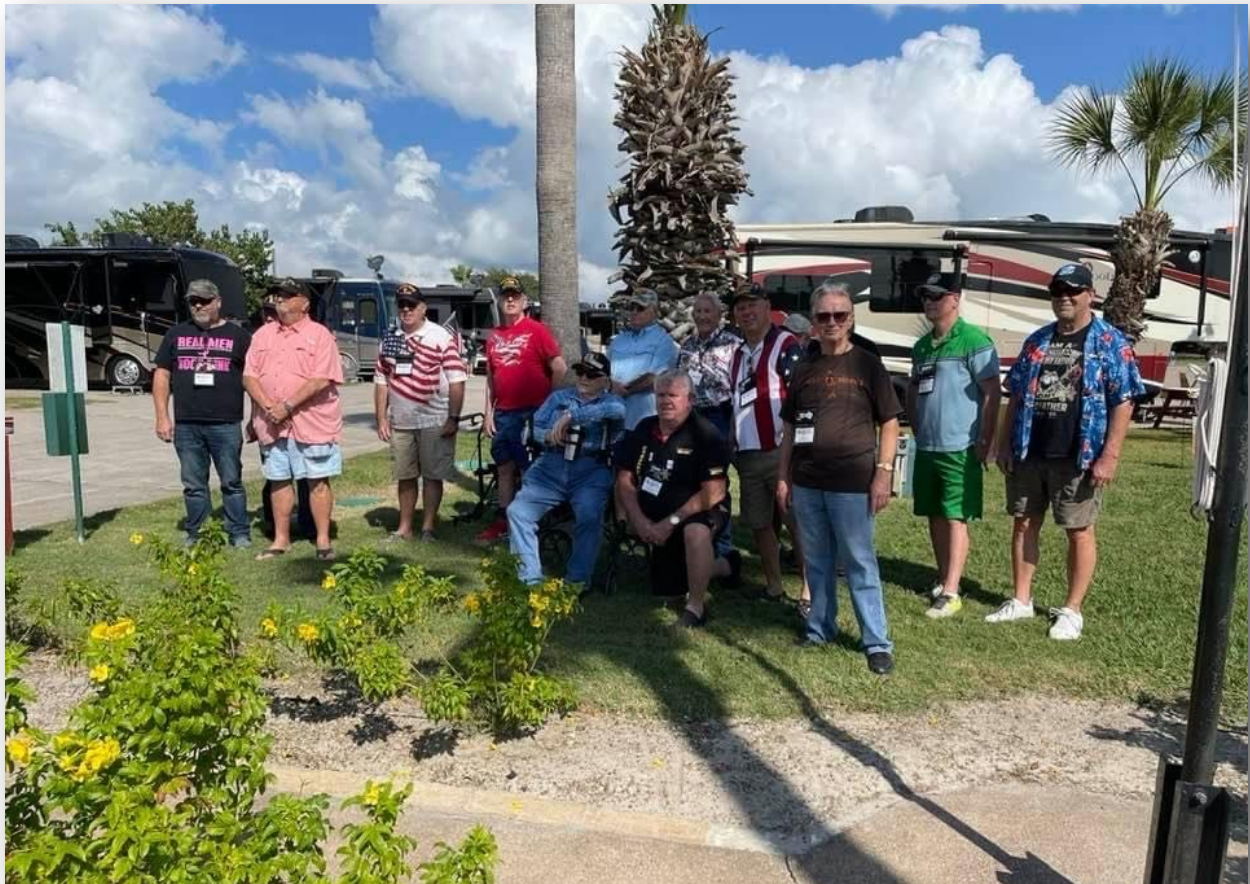
Veterans Day Celebration at Discovery Texans November Rally in Rockport, Texas