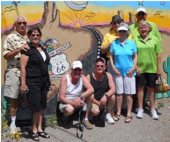
The Desert Rats enjoyed visiting a part of old Route 66.

The group enjoyed an outing to the old western town of Oatman, Ariz., for lunch, and regular evening happy hours and group dinners were held, as well as participating in some of the other activities offered by the town of Laughlin. Needless to say, fun was had by all.