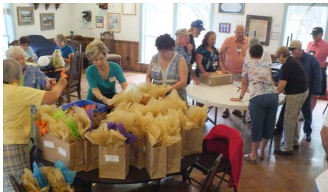
Discovery Texans putting the finishing touches on welcome bags for national rally in Shawnee, Okla.

The Texans have been busy, busy, busy working with the Disco Road Runners and Louisiana Mudbugs to host the DOAI 2011 national rally in Shawnee, Okla., this coming October. We're expecting a great turnout, and we've planned lots of activities (fun). Don't miss it. Registrations and checks must be received by Monday, September 19, 2011, so don't delay.