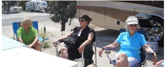
Desert Rats in Laughlin, ready for dinner