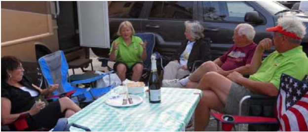
Desert Rats in Laughlin, sharing stories