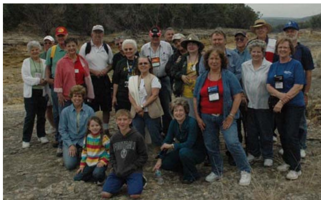
Discovery Texans had a blast at Canyon Lake Gorge.

Our March rally was at Canyon Lake, where we were treated to a super tour by the Gorge Preservation Society. The Canyon Lake Gorge was created by the 2002 flood event. The gorge was eroded to depths up to 40 feet below the pre-flood