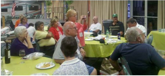
Florida Discovery Sunshiners pizza party