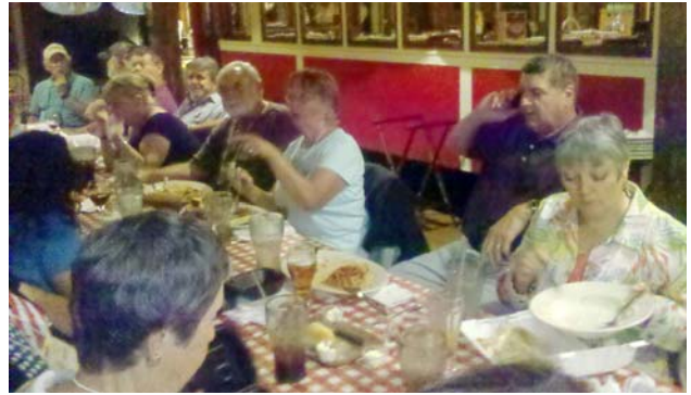
Florida Discovery Sunshiners spaghetti dinner