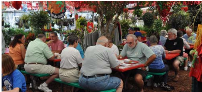
Florida Discovery Sunshiners enjoyed strawberry shortcake at Parkesdale Farm Market in Plant City, Fla.