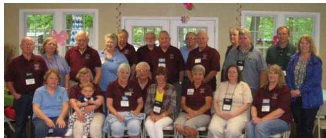
A good turnout of Mason-Dixon members at their Virginia rally.

and one SOB attend. That was a great turnout for our chapter.