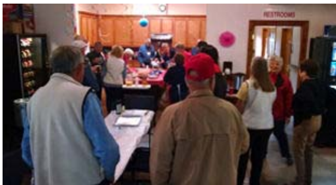
Getting ready to eat at the La Marque rally.

From March 30 to April 2, we were in La Marque, Tex., at Ron Hoover Oasis RV Park. We had some fog, along with light and heavy rain. There was a lot of visiting, game playing, shopping, and sightseeing. Many of us had seen the area sights, but enjoyed revisiting the area; pretty old homes, Moody Gardens, and the Bishop Mansion, etc. The park management provided us with donuts and coffee Wednesday and Thursday mornings, as well as a BBQ lunch on Saturday. Sweet! As usual, the Discovery Texans enjoyed their eats, visiting, and playing games like Sequence and Jokers & Marbles.