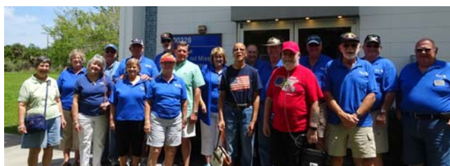
At the Air Force Space and Missile History Center.

avoid the Florida heat. Many of them are planning to incorporate the DOAI national rally in New York in their summer travels. I hope to see many of you there! ❖