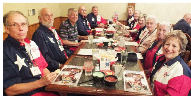
Photos of Discovery Texans at the feeding troughs... er, the dining tables at Mamacita's in Fredericksburg.

May 18-21, we were in Stonewall, Tex., at the Peach