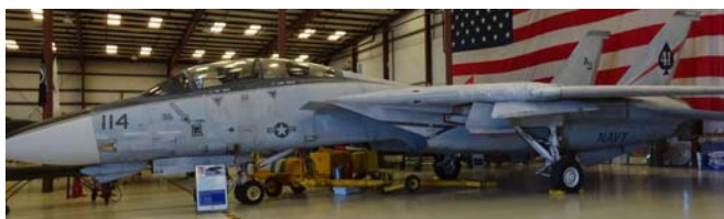
An F-14 Tomcat at the Warbird Museum.

On Monday, we went to the Air Force Space and Missile History Center. The tour is normally a self-guided one, but since our group was large, an 88-year-old attendant offered to provide a guided tour. What a wealth of knowledge this person possesses! He began working with the space program in the 1950s, and has been with them through each iteration (and accidents) of the program until it was privatized a few years ago. What a super tour of the history of our country's space program.