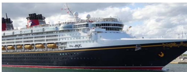
The Disney Magic Kingdom cruise ship.