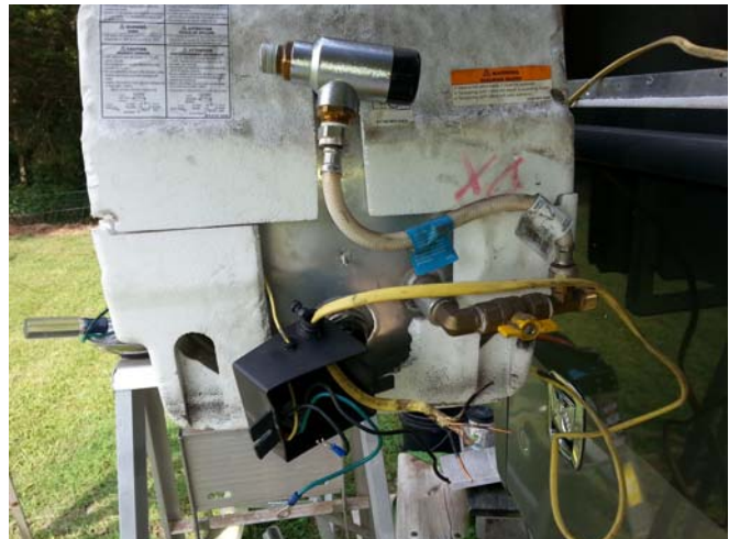
Photo 4: The water heater out of the D on a ladder. You cannot tell the difference from the white wire and the black wire; even the solid copper wire is black.