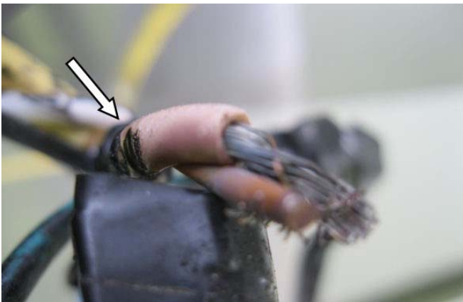
Photo 3: This is the ground wire which is supposed to be white; as you can see, even in this b/w photo, its color has drastically changed. Notice the dark burnt place on the cable. It got super hot.