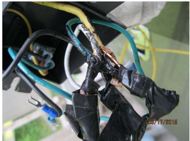
Photo 2: In this photo, you will notice the clump of wires, all taped together – hot, ground, and neutral. This is not the way to do it. I cut off the incoming 120V wire and rewired everything.