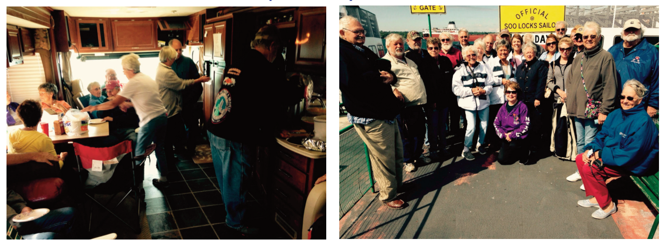
Members of the Midwest chapter enjoying themselves at the SOO Locks during their group rally in June.