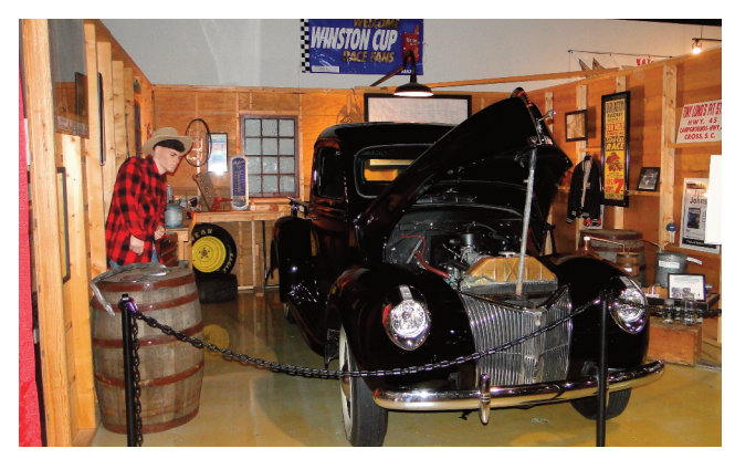
The start of NASCAR. The moonshine truck carried the moonshine made in the still.