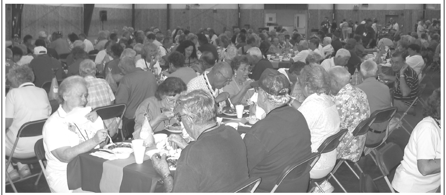
DOAI NATIONAL RALLY AT KENNEWICK, WA MAKES LOCAL NEWSPAPER HEADLINES