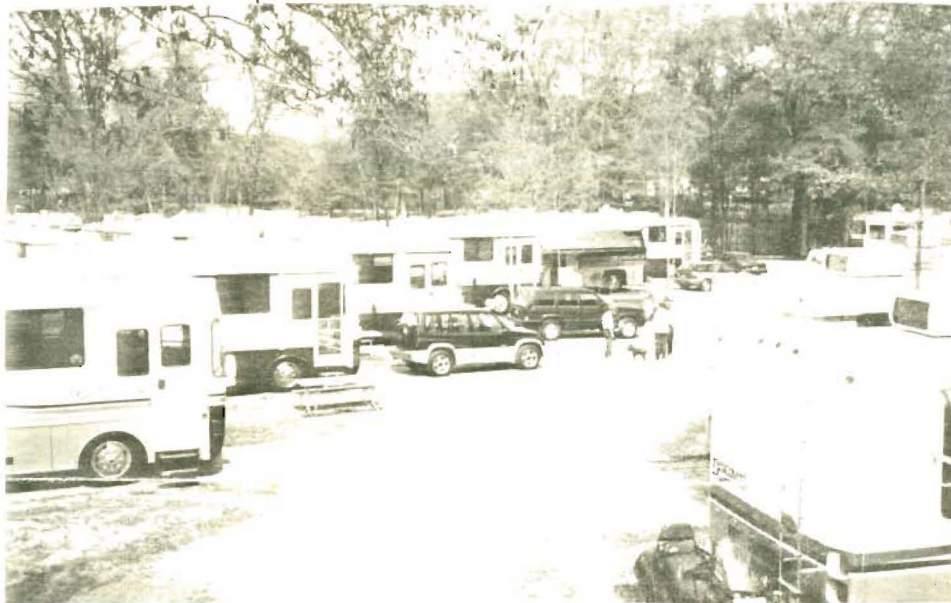
Discovery Owners rally! This photo taken at FMCA pre-rally, Perry Georgia