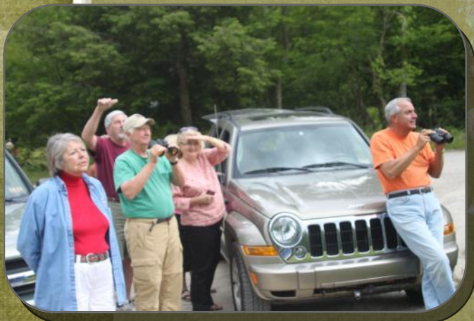
Rally Host out looking for Black Bear and it looks like they found one!