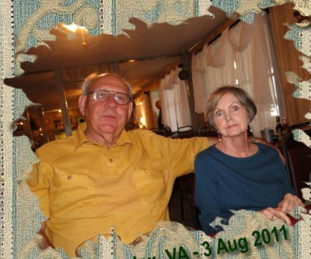
Galax, VA - 3 Aug 2011