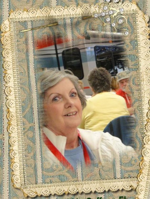
28 Jan 2011 - Seffner, FL