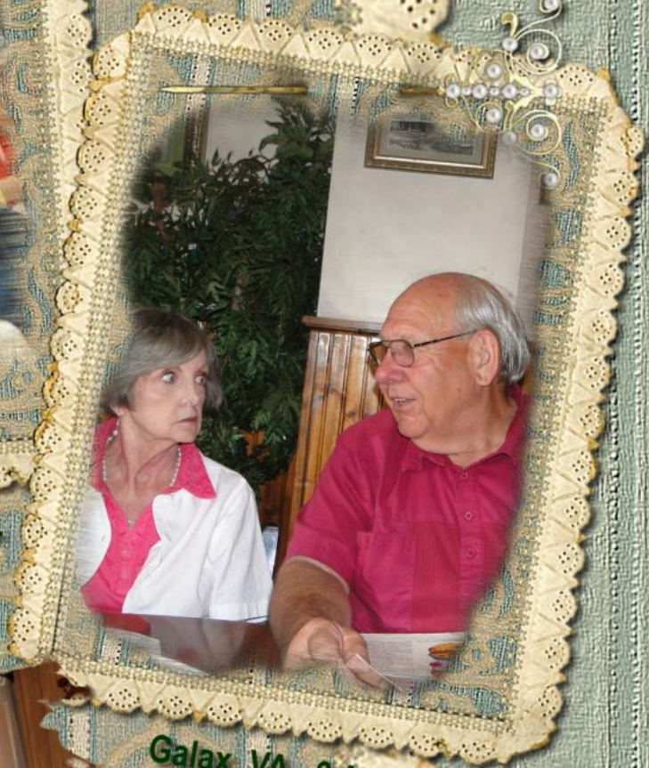
Galax, VA - 6 Aug 2011