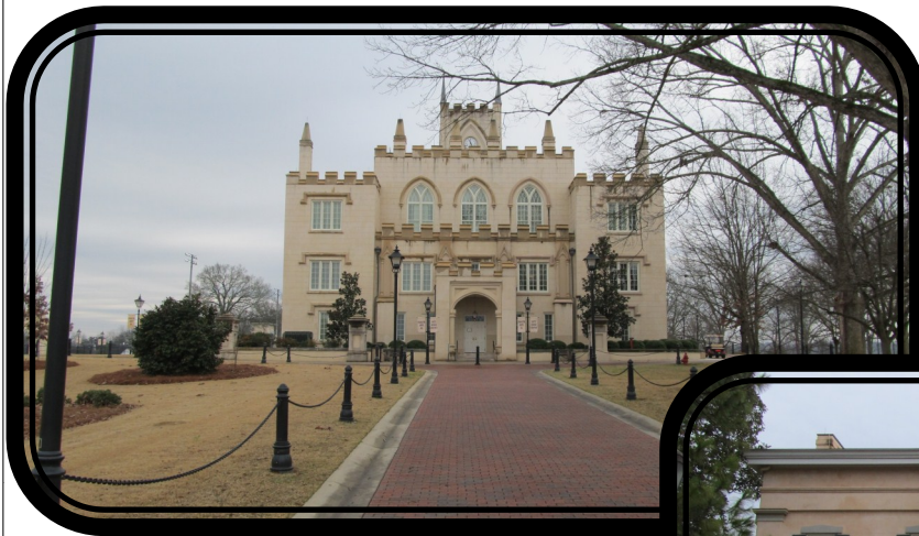
1860 GEORGIA CAPITAL MILLEDGEVILLE

For you history buffs, if you would like to see some historical area of Georgia these three areas would be a great place to visit.