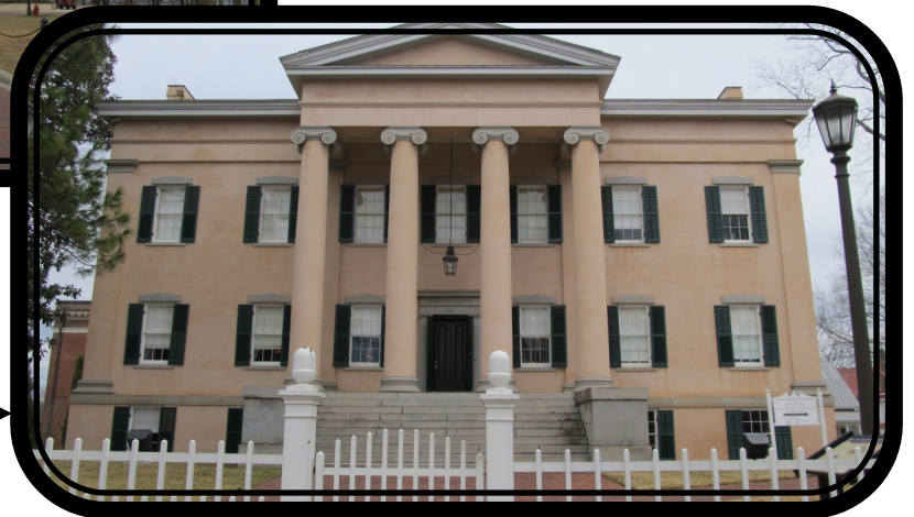
1860 GEORGIA GOVERNORS MANSION MILLEDGEVILLE