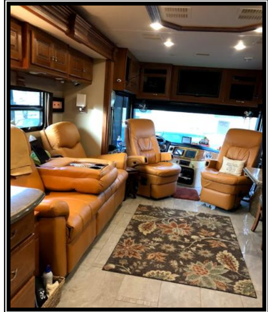
Leydic's—After room Sofa and Captain Chairs