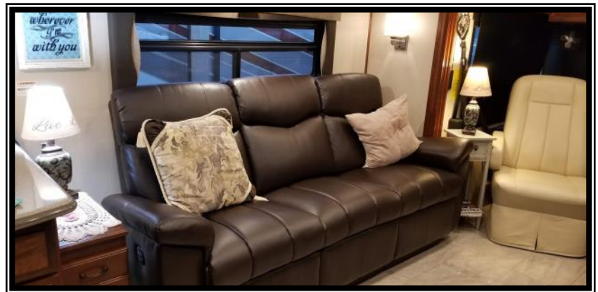
Blaher's— After Sofa