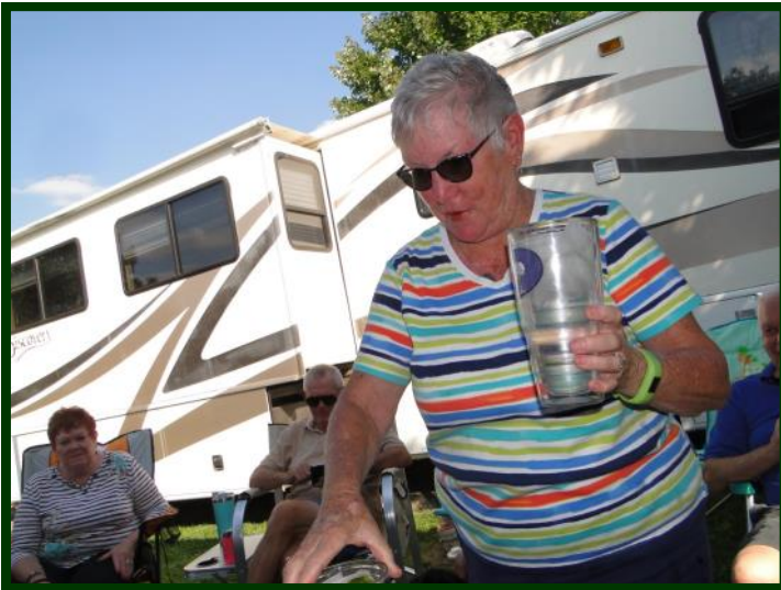
You sure that glass is large enough Katy?