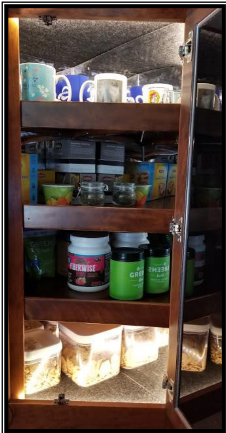
The Blaher's also installed new cabinet shelves—how nice