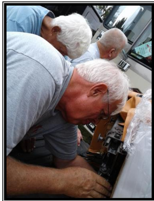
Not an easy job—took several tries to finally get it all together. Thank heaven for Blue Ridge assistance