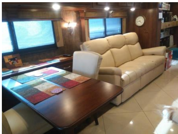
Hopkins—After their new room