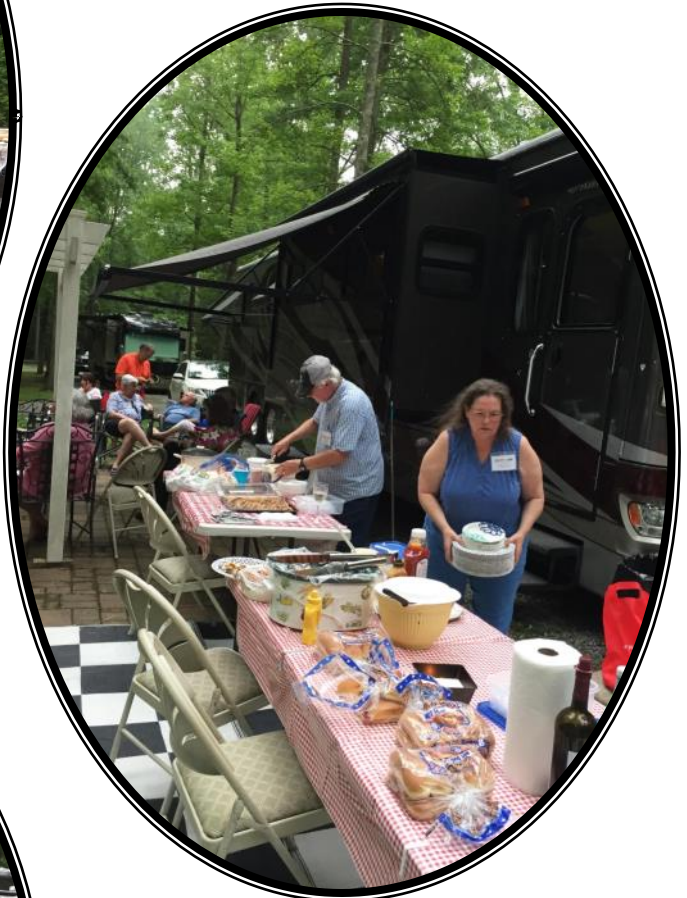
Tons of good food....