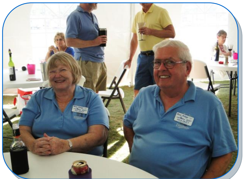
Beautiful smiles for beautiful people