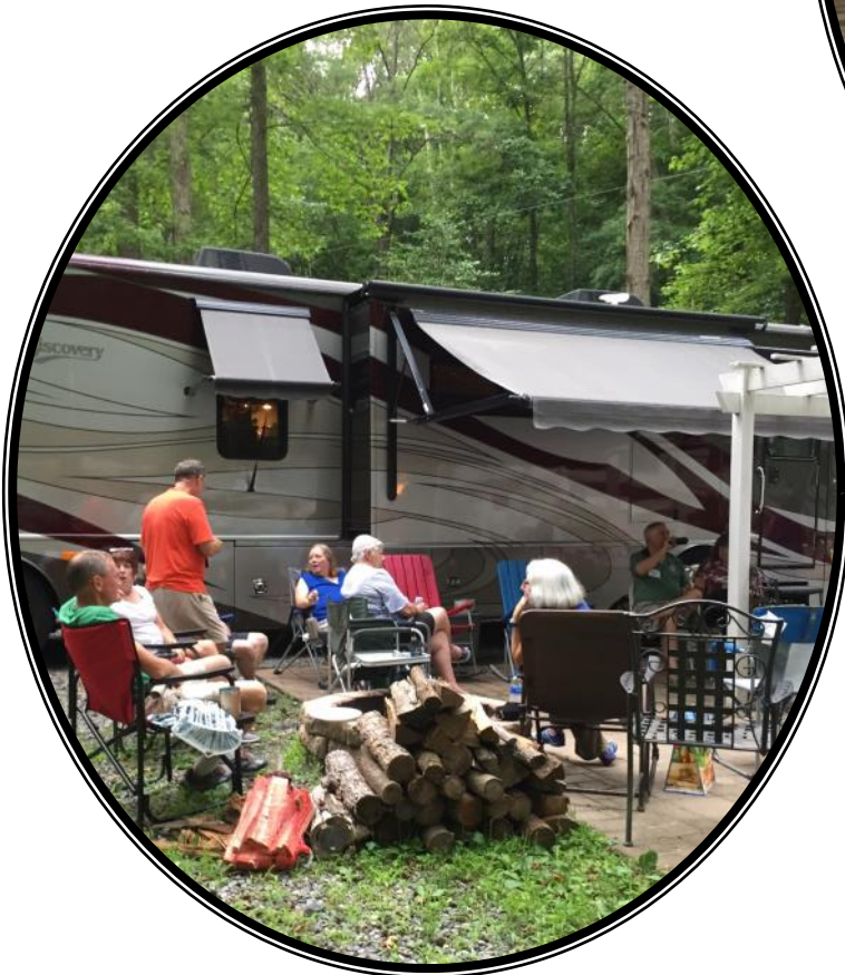
Are you really going to burn that wood??