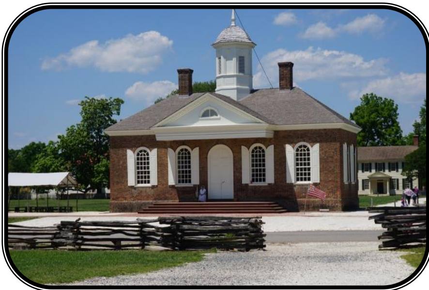
Williamsburg, 25 Apr 2019