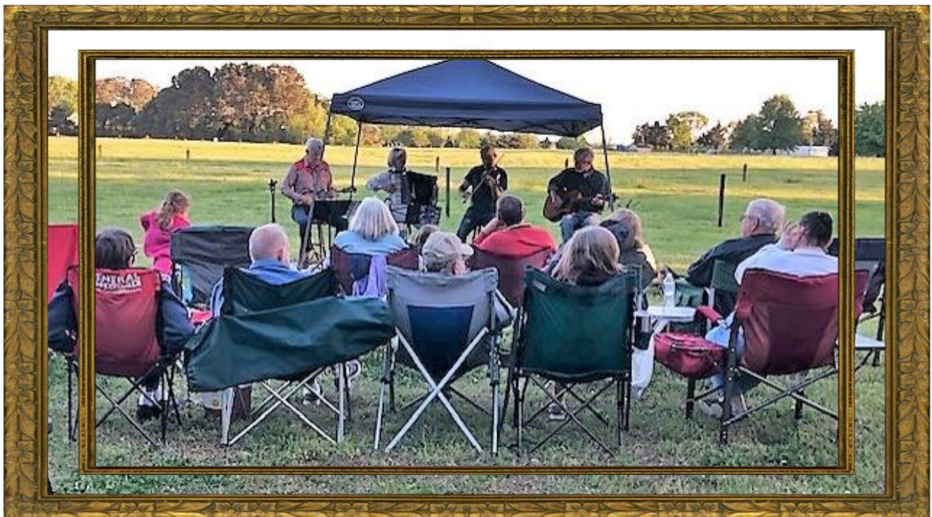
ENTERTAINMENT- Route 5 Ramblers