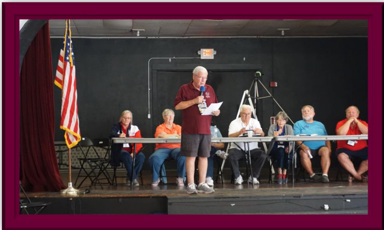
DOAI Board Members 28 September 2019