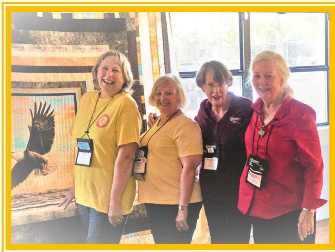
Some of the quilters