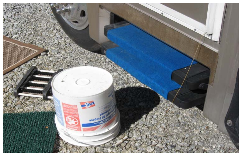
Note the retracting string.