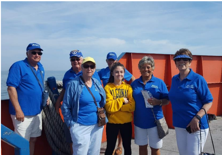
Ferry Boat Ride, Look at all that Blue!