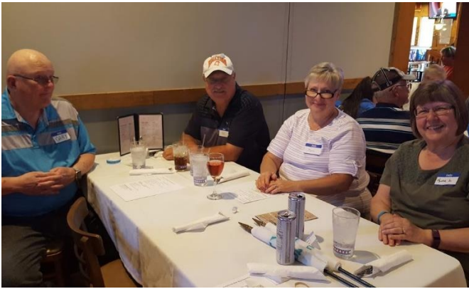
More Dinner Pictures