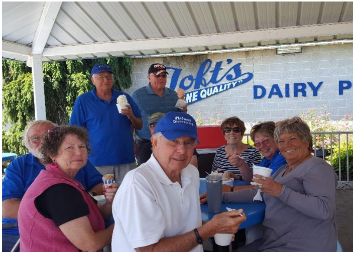
And here we are eating again!