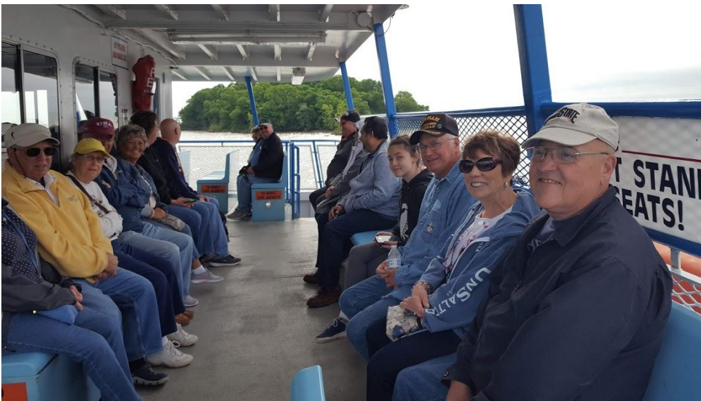
As it is 90+ degrees in most parts of the country, this picture looks refreshing.