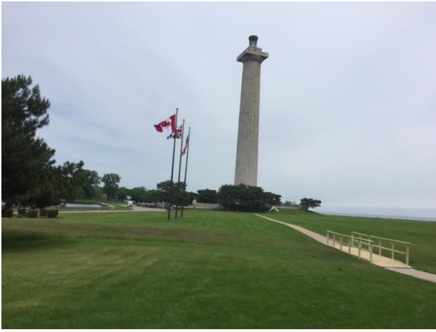
Perry's Victory and Peace Memorial