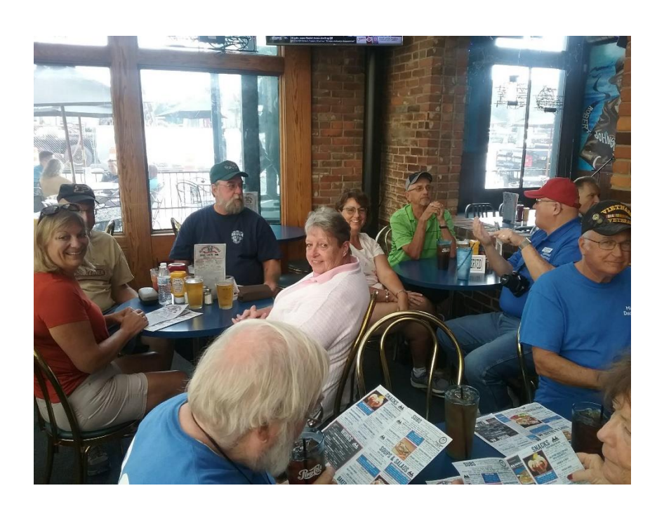
Unbelievable, we are eating again!