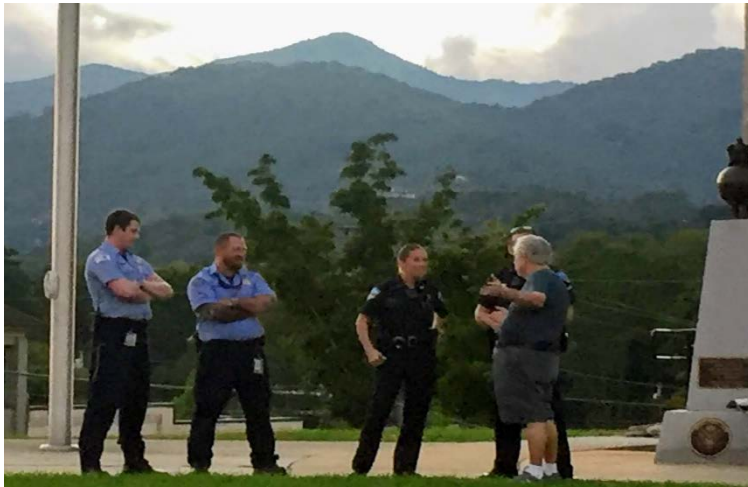
Waynesville Street Party, with our First Responders in attendance!